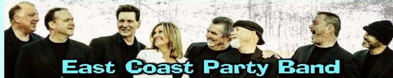
East Coast Party Band