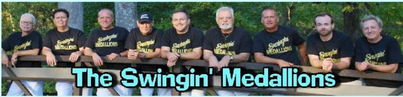
The Swingin' Medallions